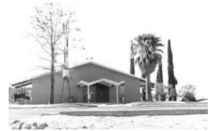
122 Church Drive Mammoth, Arizona, 85618