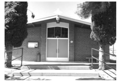
609 W. Park Pl San Manuel, Arizona, 85631