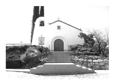
66 E. Maplewood St. Oracle, Arizona, 85623