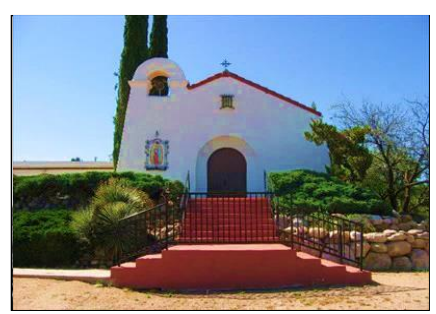
66 E. Maplewood St. Oracle, Arizona, 85623