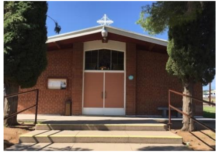
609 W. Park Pl San Manuel, Arizona, 85631