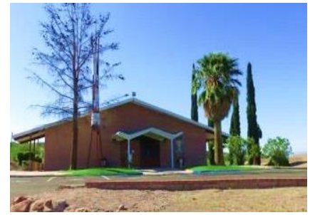
122 Church Drive Mammoth, Arizona, 85618