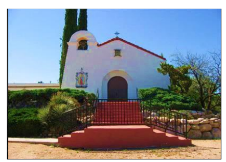
66 E. Maplewood St. Oracle, Arizona, 85623

Phone: (520) 896-2708 Email: sthelensmission@msn.com