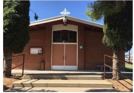
609 W. Park Pl San Manuel, Arizona, 85631